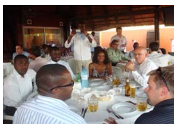
Team building 2008