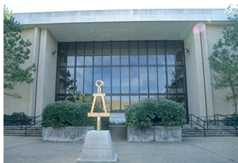
The Cullen College of Engineering, University of Houston

Suggestions for team building events during 2009 are under review and will be scheduled to coincide with significant project milestones.