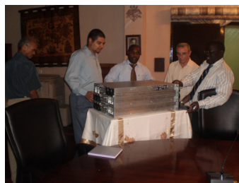
Presenting the two servers to the IT Manager of the UAN

Paragon Angola offices and are now installed in the classrooms to enhance the education of the local children.