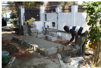
The plinth being laid for the new standby generator

Replacement minibus transportation has now been sourced for expatriate personnel and will be delivered to Luanda later this year. This transportation will be fully compliant with AMEC safety requirements and should offer a significant increase in comfort for the team when traveling to and from work.